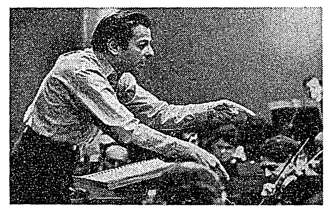
André Previn rehearsing the London Symphony Orchestra

He went on to compose more than 30 original film scores